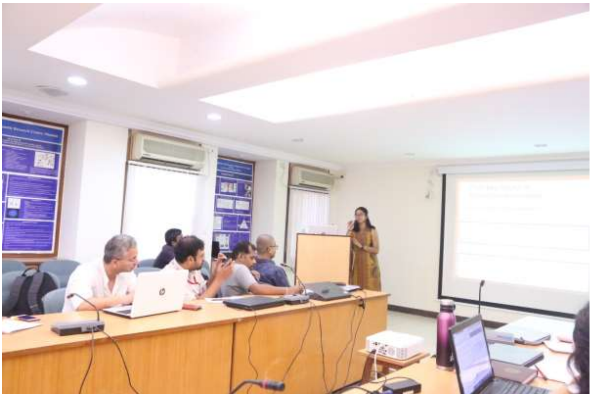
Orientation Talk on HTA to academicians