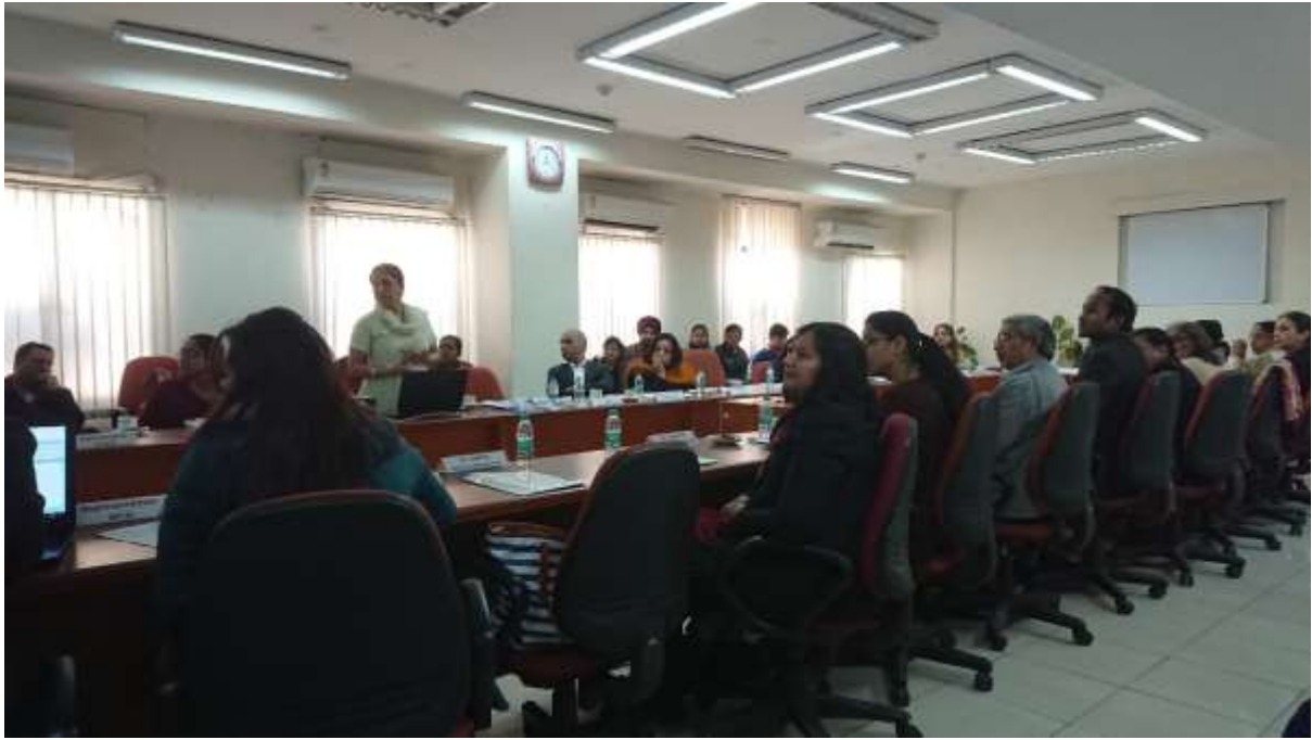
Stakeholder consultation meeting at DHR, New Delhi